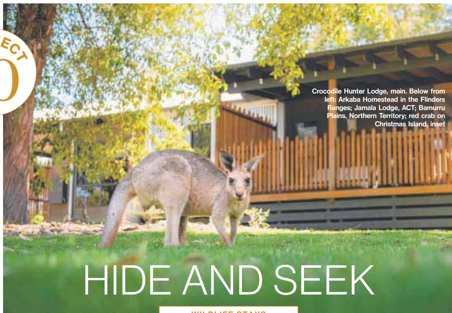
Crocodile Hunter Lodge, main. Below from left: Arkaba Homestead in the Flinders Ranges; Jamala Lodge, ACT; Bamuru Plains, Northern Territory; red crab on Christmas Island, inset

5 Port Stephens Koala Sanctuary, NSW Leisurely strolls along One Mile Beach can be enhanced with some serious wildlife spotting during a stay here. Koalas are the star attraction, so expect a few cameos from Blinky, Jackie