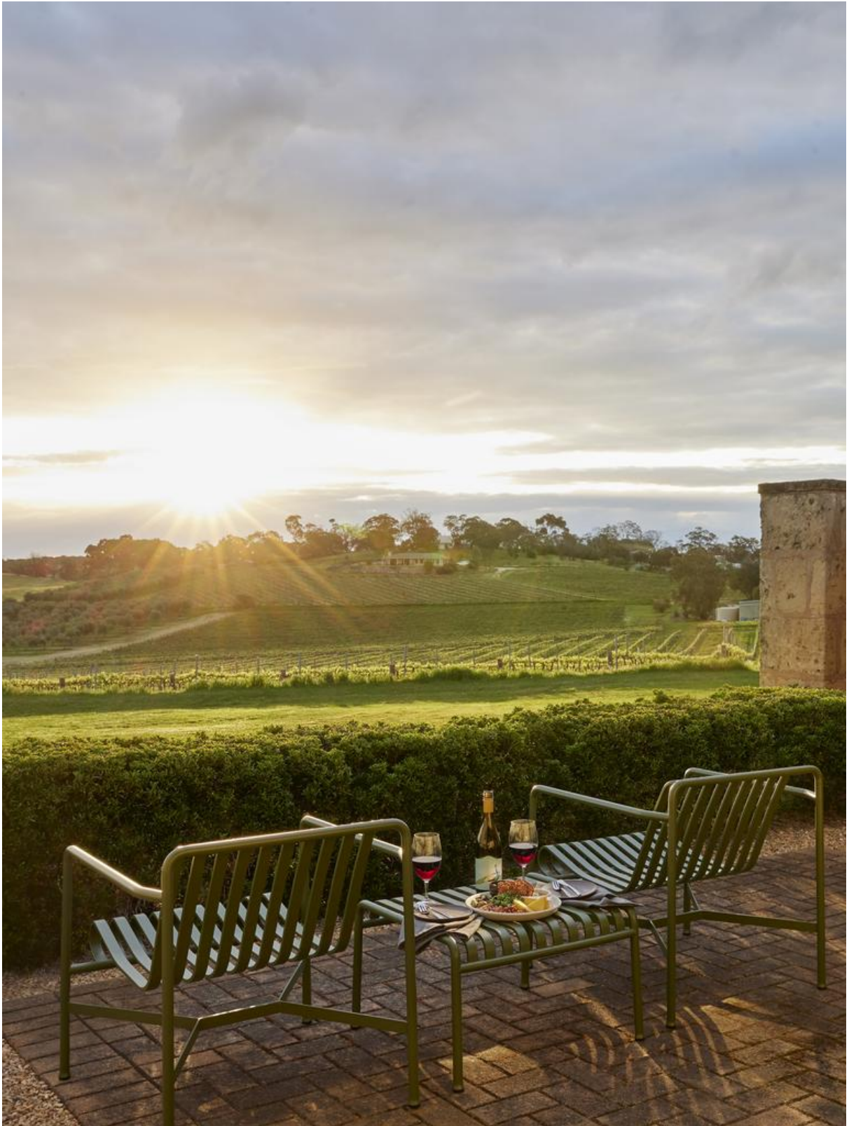
Vineyard views from The Louise.