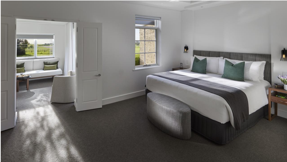
Suite accommodation at the property.