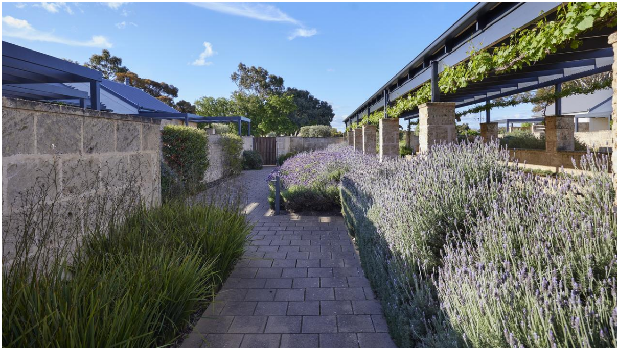
Lavender and blue skies at The Louise.

Debate could rage long and loud about which Australian wine district deserves the accolade of “prettiest” but surely the bountiful Barossa would figure in the top few. There are big skies and heritage hamlets, an abundance of producers who have diversified beyond growing grapes, and ease of access from a capital gateway city that makes day trips a piece of cake. Did someone mention cake? Make that generous country baking, a legacy of the Lutheran settlers of Silesian heritage who arrived in the 1840s and brought vine clippings and long-held recipes for the kind of sturdy buns, pies and filled pastries to nourish you through a tough, cold winter.