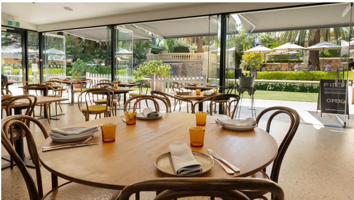
Fino restaurant at Seppeltsfield.